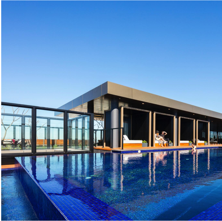
Roof top amenity