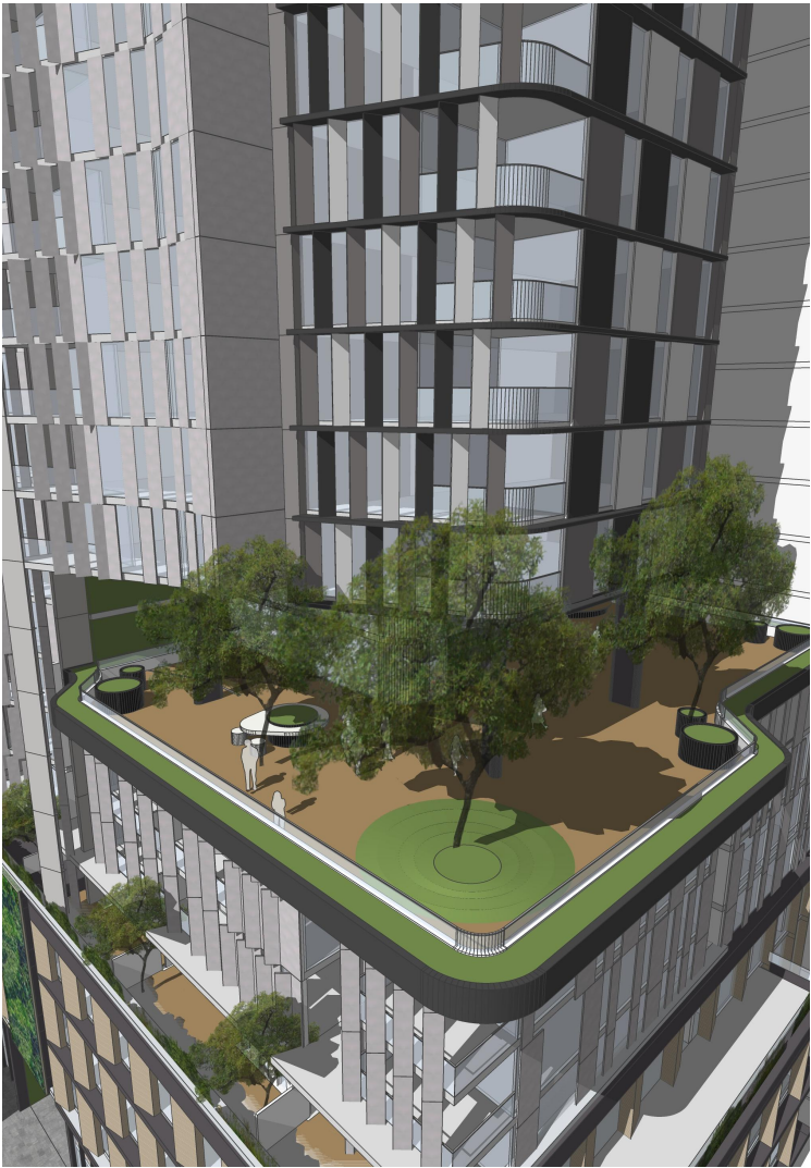
Indicative design - Rooftop amenity

NOTES THIS DRAWING IS COPYRIGHT © OF TURNER. NO REPRODUCTION WITHOUT PERMISSION. UNLESS NOTED OTHERWISE, THIS DRAWING IS NOT FOR CONSTRUCTION. ALL DIMENSIONS AND LEVELS ARE TO BE CHECKED ON SITE PRIOR TO THE COMMENCEMENT OF WORK. INFORM TURNER OF ANY DISCREPANCIES FOR CLARIFICATION BEFORE PROCEEDING WITH WORK. DRAWINGS ARE NOT TO BE SCALED. USE ONLY FIGURED DIMENSIONS. REFER TO CONSULTANT DOCUMENTATION FOR FURTHER INFORMATION.