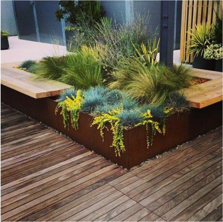
Roof top landscape